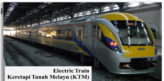
Electric Train Keretapi Tanah Melayu (KTM)